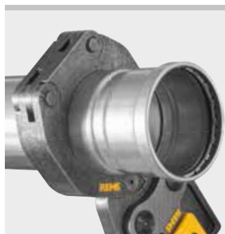
REMS pressing rings (PR-3B)