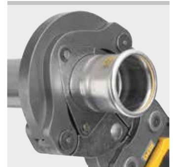
REMS pressing rings (PR-3S)