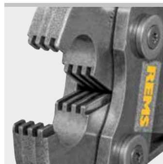
Pressing tongs with teeth Patent EP 2 027 971