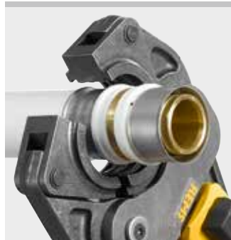
REMS pressing tongs (S)