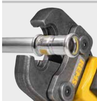
with 2 swivellable monoblock pressing jaws. Most sold