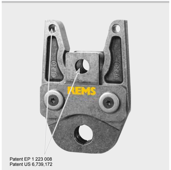
Patent EP 1 223 008 Patent US 6,739,172

With this traceability REMS fulfils the recommendations of the European standard EN 1775:2007 for the installation of pressfitting systems for gas.