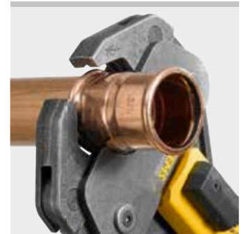
REMS pressing tongs (4G)